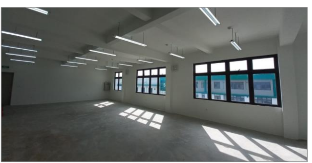
Internal view of the office space