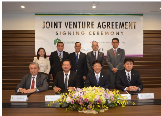
Photo of the joint venture agreement signing ceremony