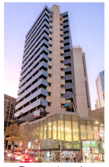
The property's exterior

※1 Central Business District, referring to a district where government offices, businesses and commercial facilities are concentrated in the urban area.