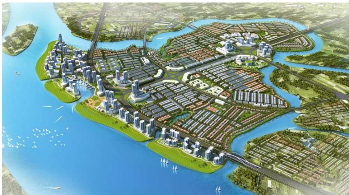
Illustration perspective of [Izumi City Project]