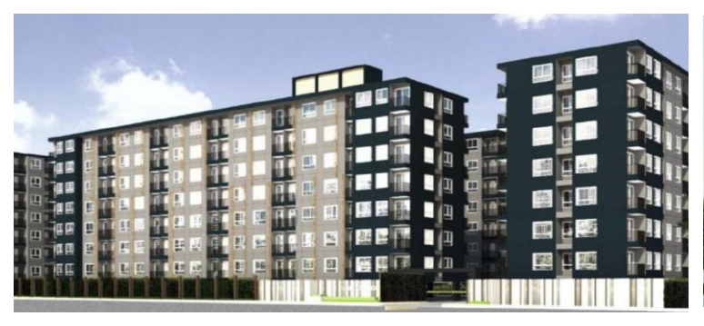
[ (tentative name) Klong 1 project]