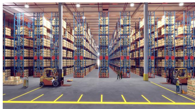
Artist' s impression of interior perspective