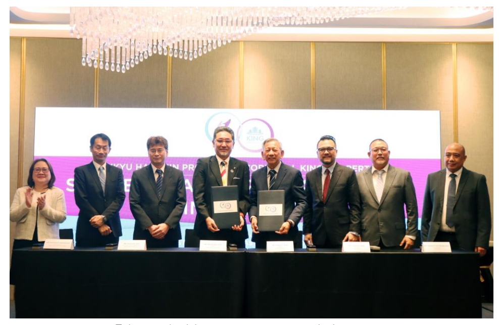
Taken at the joint venture agreement signing ceremony

While our company has already been advancing six projects in partnership with PA Alvarez Properties (hereinafter referred to as "PA") in the Manila Metropolitan Area, we have decided to participate in these two new housing projects in the Cebu Metropolitan Area.