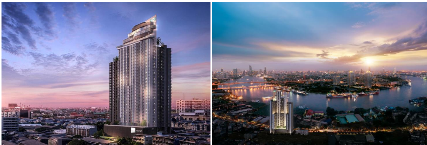
※[Niche Mono Charoen Nakorn] perspective