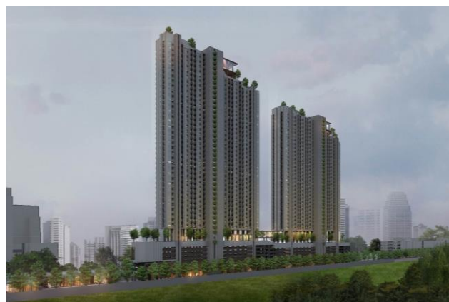
※[PITI Bangchak], [Niche Mono Ramkhamhaeng] perspective