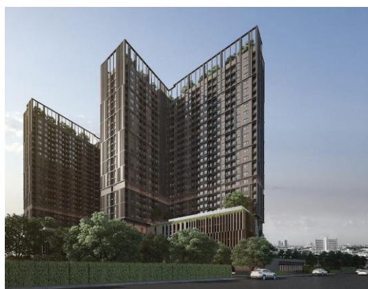
※[(tentative name) Rama 9 project], [(tentative name) Chaeng Watthana project] perspective