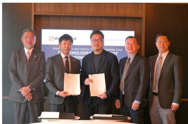
At the signing ceremony for the Lengkong Wetan Project

Hankyu Hanshin Properties Corp. (hereinafter referred to as “HHP”) is pleased to announce its participation in a housing project, the “Lengkong Wetan Project” (hereinafter referred to as “the Project”), in the BSD City of the Jakarta metropolitan area, Indonesia. We will be undertaking this Project in collaboration with Bumi Serpong Damai (hereinafter referred to as “BSD”), a subsidiary of Sinarmas Land, the largest real estate developer in the country.