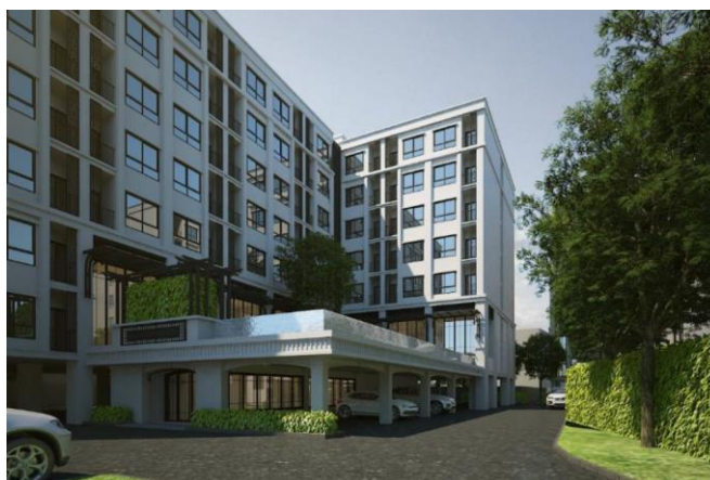
※[(tentative name) Bang Pho project], [(tentative name) Itsaraphap project] image