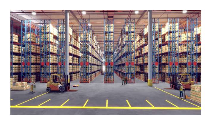
Artist's impression of interior perspective