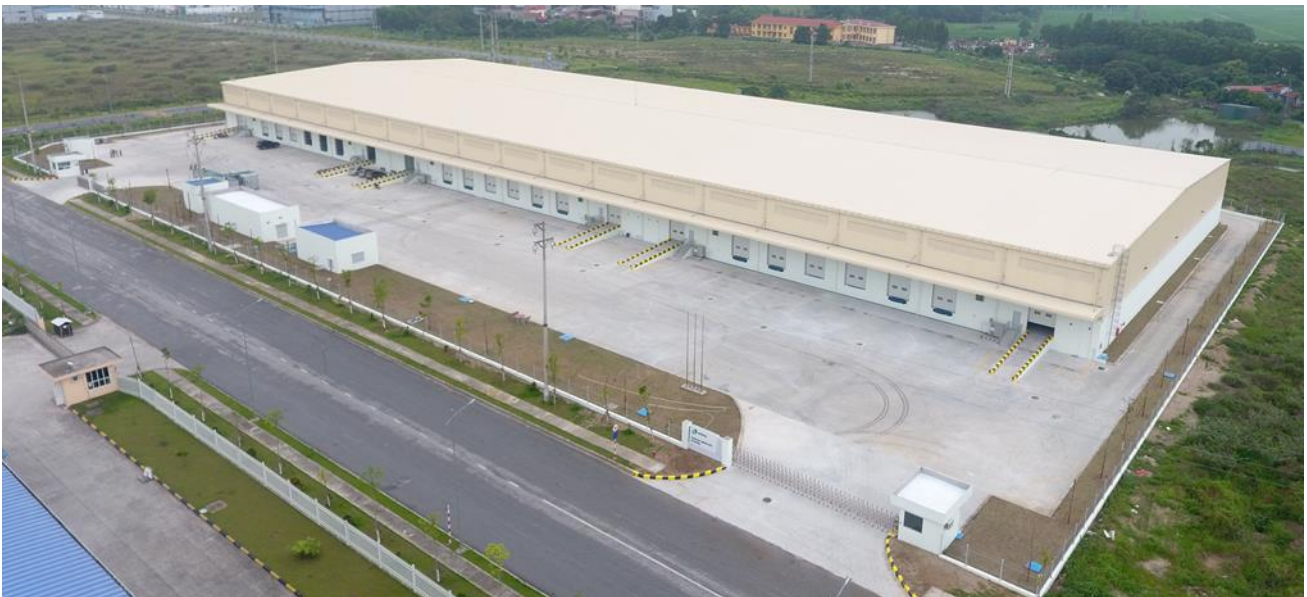
A photo of the entire

We are proud to announce that “Sembcorp Logistics Park (Hai Duong)” , located in VSIP Hai Duong Industrial Park was completed on 24 April 2022.