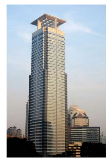
Sinarmas MSIG Tower

%1: DCP owns 13 floors. %2: DCP will own 23 office floors after its completion.