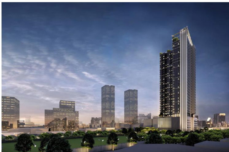
Phase image of [(tentative name) Bangna Phase 2 Project]

[(Tentative name) Bangna Phase 2 project] is the second phase (approximately. 740 units) of the 795-unit [Niche Mono Mega Space Bangna] project, which is currently being sold on an adjacent site. As the project is located close to the center of Bangkok and in an area with a concentration of industrial estates, residential demand is expected.