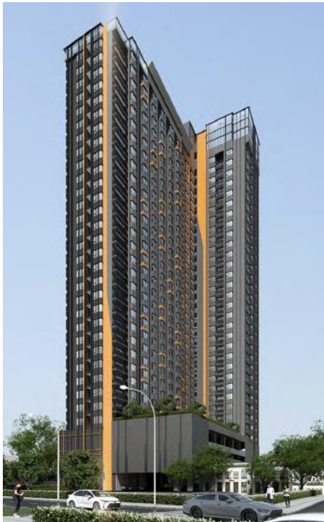
[(tentative name) Charoen Nakorn 2 project]