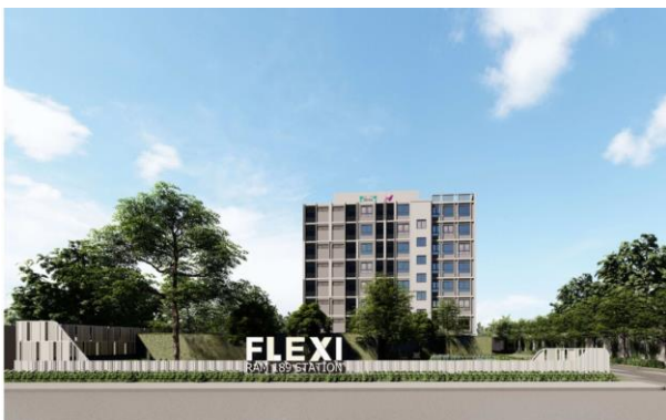
[(tentative name) Bangchan project]