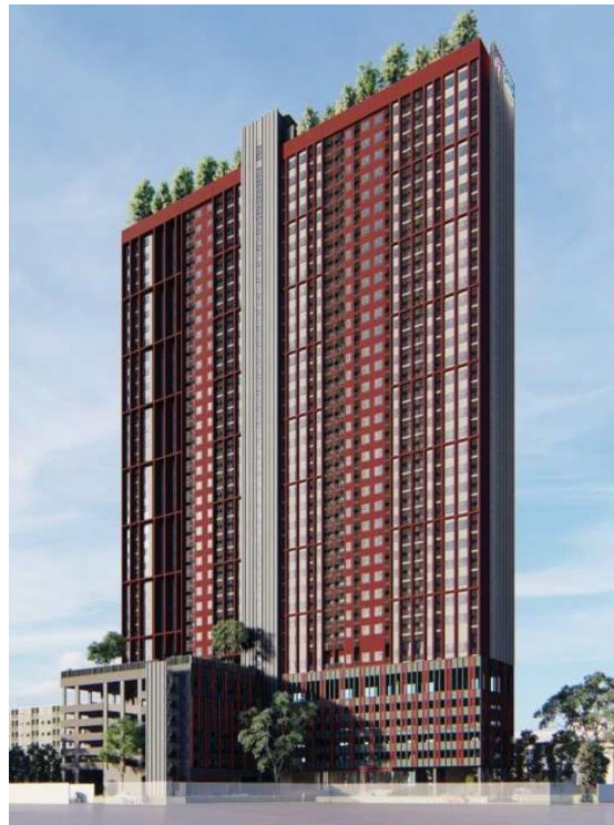
[(tentative name) Samrong project]