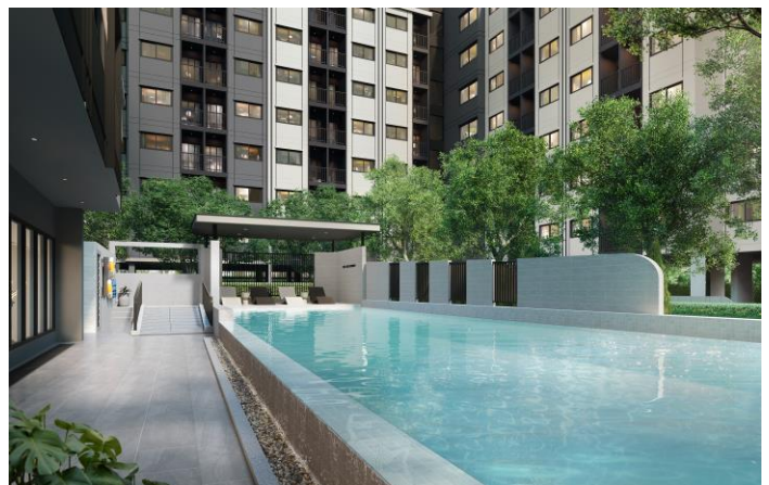
“COZI RAMINTHRA KHUBON” Common area (rendered image)