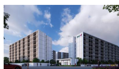
Rattanatibet Bangbuathong Project ㉘