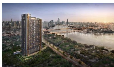
Flexi Riverview Charoen Nakhon ㉓

* For detailed information about individual projects, please visit the Overseas Business section of our company website. https://www.hhp.co.jp/services/global/