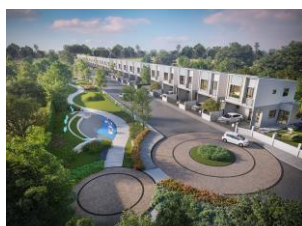
SENA VELA Sukhunvit Bangpoo ㉔