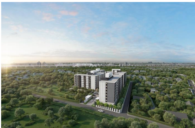
“COZI RAMINTHRA KHUBON” Exterior (rendered image)