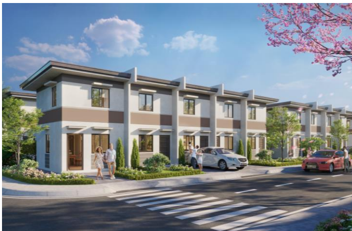
“Alaminos Project” Townhouses (rendered image)

Comprehensive information about the “Alaminos Project” and ” Summit Project” can be found in the subsequent pages.