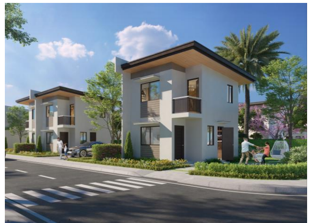
“Summit Project” Detached houses (rendered image)