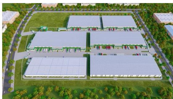
External view (visual perspective)